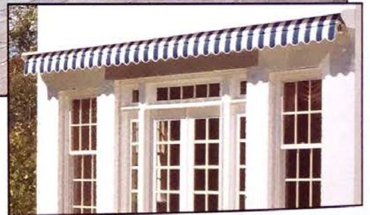
The Sunflexx® awning is fully retracted.

Shown here is Eastern's Sunflexx® retractable awning with its unique Wind & Rain Package. Set up is quick, easy and takes only one to two minutes. Eastern's exclusive Wind & Rain Package enables expanded use of your Sunflexx awning during a much broader range of weather conditions. It is available on widths up to 30' and projections up to 12'.