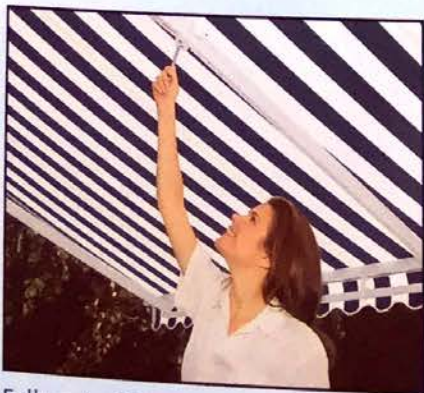
Fully extend the awning and simply insert the supplied pins in each elbow.