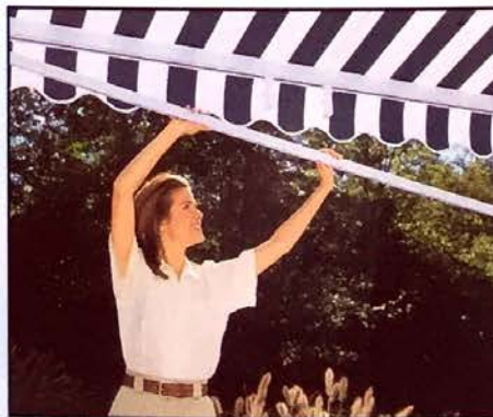
Swing the poles down from behind the valance.