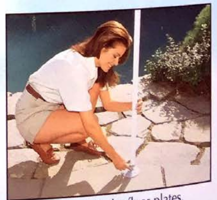
Clip the poles into the floor plates. Tighten the fabric and enjoy!